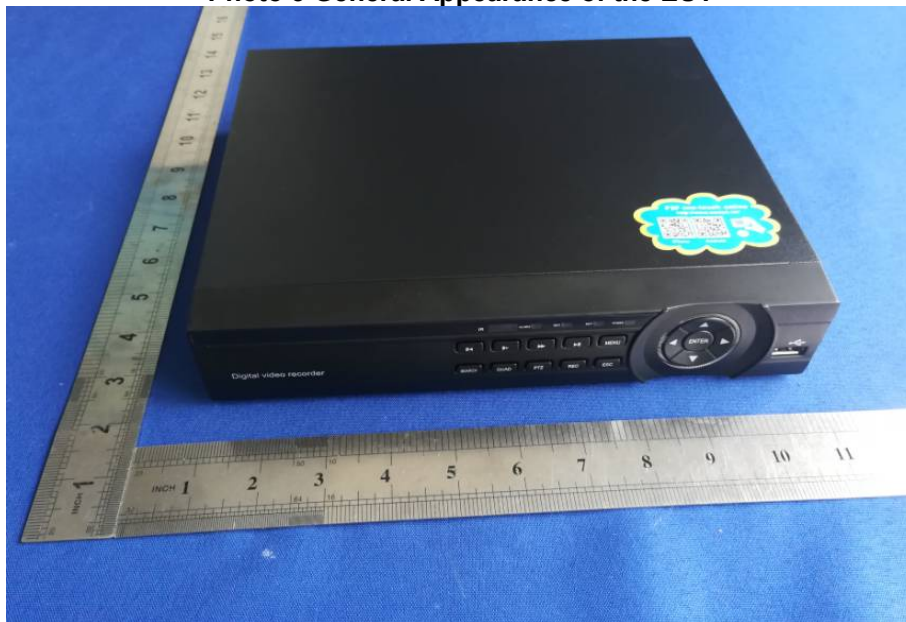
Photo 4 General Appearance of the EUT