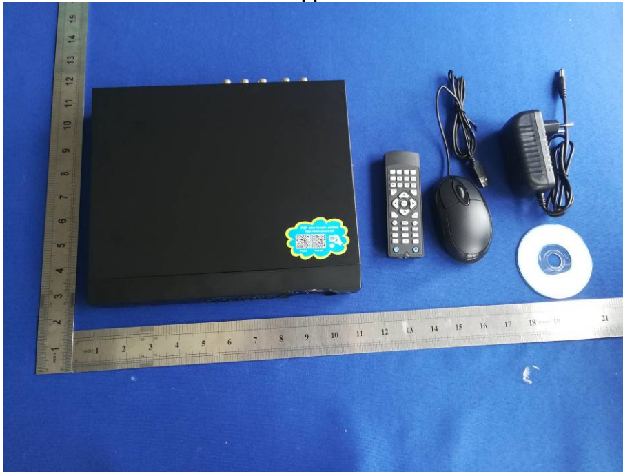
Photo 2 General Appearance of the EUT